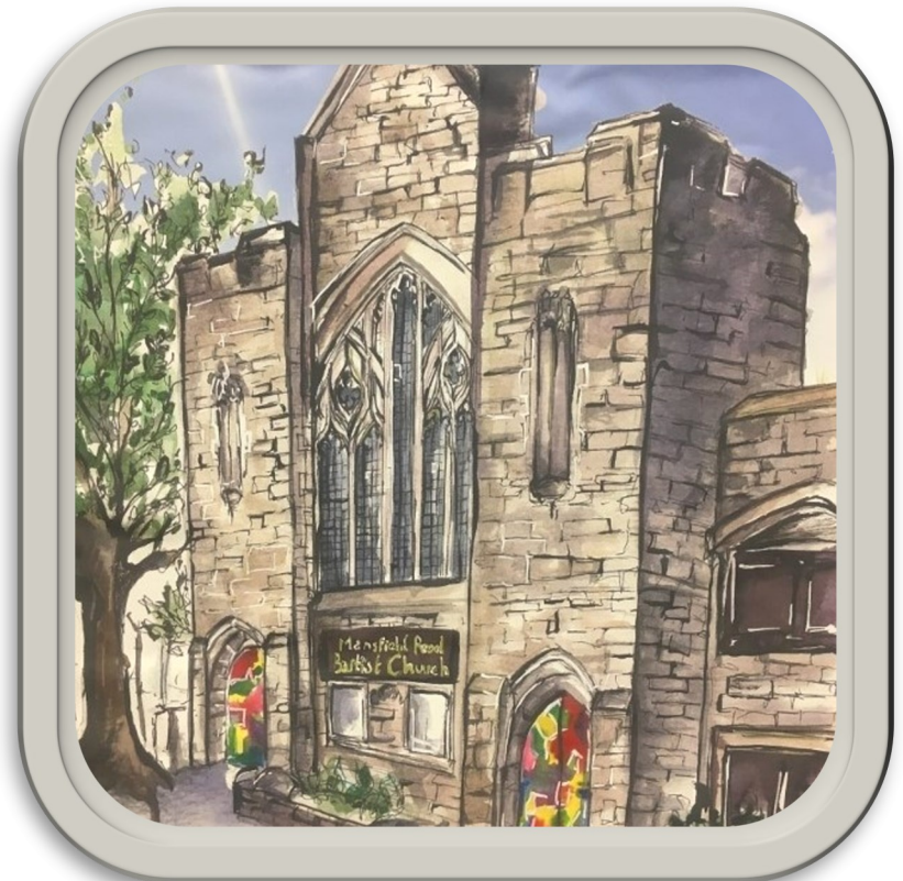
Mansfield Road Baptist Church