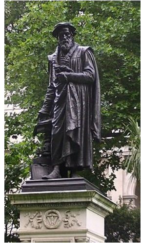
Statue of William Tyndale on Victoria Embankment, London

We are entering the month of October. In Church history, this month the Church celebrates the feast of William Tyndale (1494-1536), which is on the 6th of October. William was a Biblical Scholar and translated the Bible from Hebrew and Greek texts into English and he was also one of the protestant reformers. Therefore we as English speaking Christians have the chance to say, thank God that He raised such people to become God's servants who spread God's good news through the translation of the Bible.