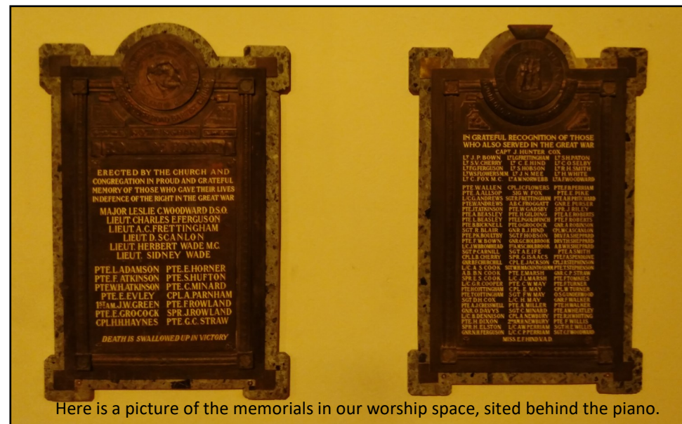
Here is a picture of the memorials in our worship space, sited behind the piano.

With the shared history and close proximity of the two congregations down the years it is most fitting that the memorial plaques should find a new home in our buildings, and with this little potted history we may be able to look at these memorials and picture in our minds some of their glorious history.