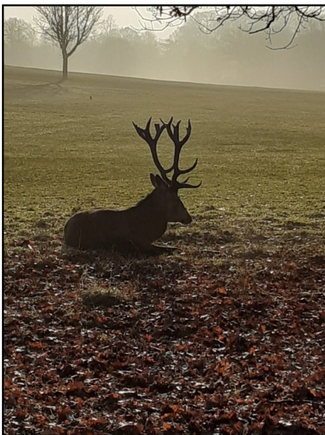
Tony Peace took this photo showing a silhouette of a deer in the low winter sun during an early morning walk at Wollaton Park